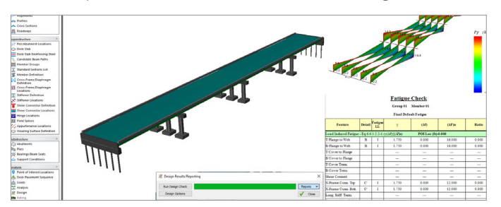
Create multiple design alternatives with different analytical methods to optimize your bridge design.

Modeling in a 3D environment helps rapidly verify bridge geometry. The bridge is seen in plan, elevation, and cross-section views. A variety of deliverables can be generated using OpenBridge Designer. It also facilitates the evaluation of multiple bridge alternatives, construction sequences and costs reports, and well-organized analysis and design reports. You can utilize iTwin<sup>®</sup> Design Review workflows for 2D and 3D design review in a web-based environment that streamlines review sessions on design work-in-progress deliverables. OpenBridge Designer, with its seamless interoperability with ProStructures, can be used for concrete detailing. OpenBridge Designer also offers a companion installation of LumenRT to create stunning visualizations.